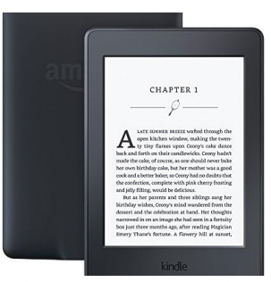
Kindle Paperwhite includes access to Kindle Unlimited Subscription