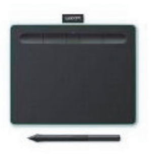
Wacom Drawing Tablet