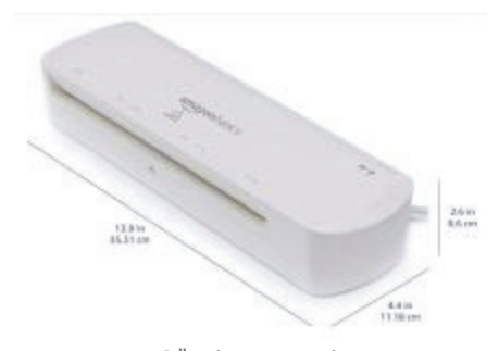
9" Thermal Laminator