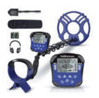
Metal Detecting Kit

Many of our patrons know and love the Tech2Go collection. We have checked out Mobile Hotspots and Roku Streaming Sticks for several years. These devices enable access to the internet on the go, or free access to streaming channels like Netflix, Hulu, Max, Disney+, and more. This collection is always evolving, with some of our newest items including: